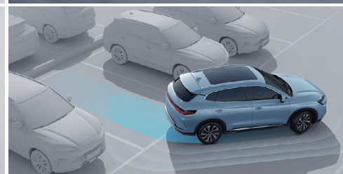
Dipilot-driving Assistance System