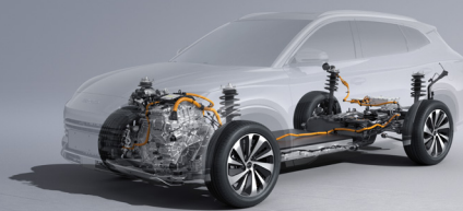
Revolutionary Electric Hybrid System (EHS)