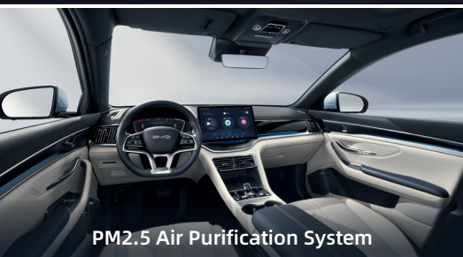
PM2.5 Air Purification System