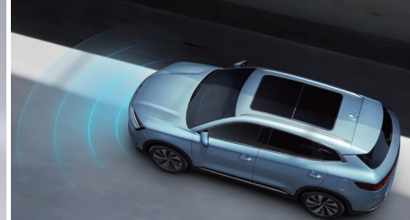
8.3s 0 - 100km/h Acceleration